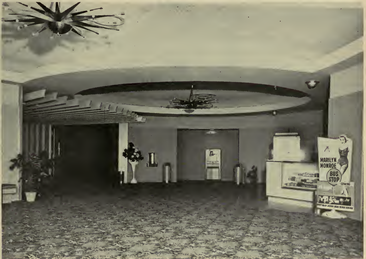
Red and gold carpeting with its custom-designed starburst pattern dominates the decor of the lobby. The starburst idea also is carried out in the light fixtures. Restrooms are at the far end of the lobby, with