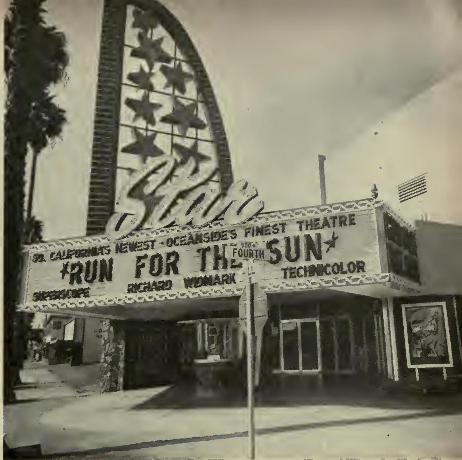
An arched entranceway, with natural rock as the finishing material distinguishes the Star Theatre. The terrazzo flooring reaching out to the sidewalk, the steel framing for the display cases and doors and recessed dome lights create a simple elegance in the area.